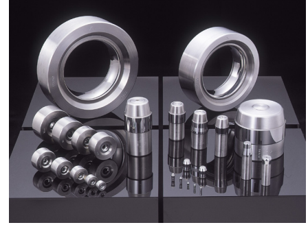
Drawing Dies & Mandrels

We have been engaged in the integrated production of these cemented carbide products, from provision of the raw metal powder to product design, sintering, casting, and product inspection at ultraprecise levels.